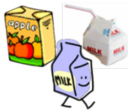
Empty Juice and Milk Cartons