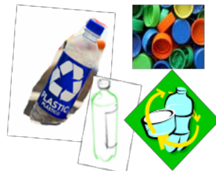
Rigid plastic containers 1 through 7