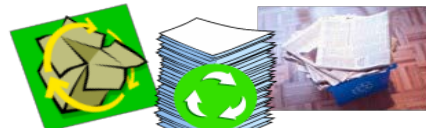
Flattened cardboard, newspaper, office paper, magazines, junk mail, paper bags and brochures