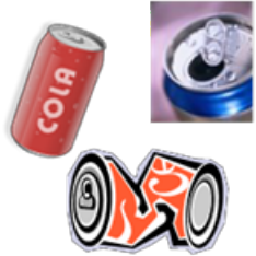
Aluminum and tin cans