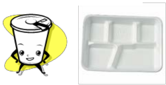
Cups and trays